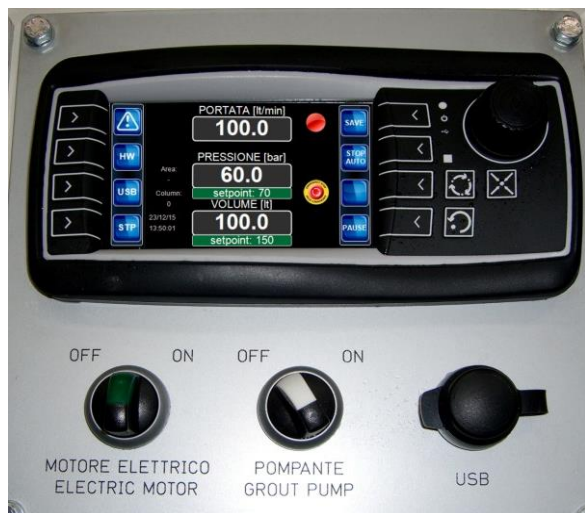
LCD Control panel (optional) with recording system and preset volume / pressure injection control